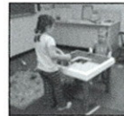
Older children helping the younger ones.