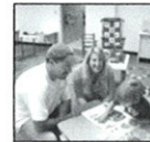
A family enjoys the time together.