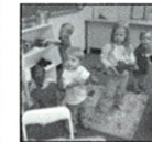
Socialization and learning to play nicely together are important skills to learn too!