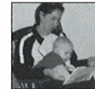
Start reading to your child early.